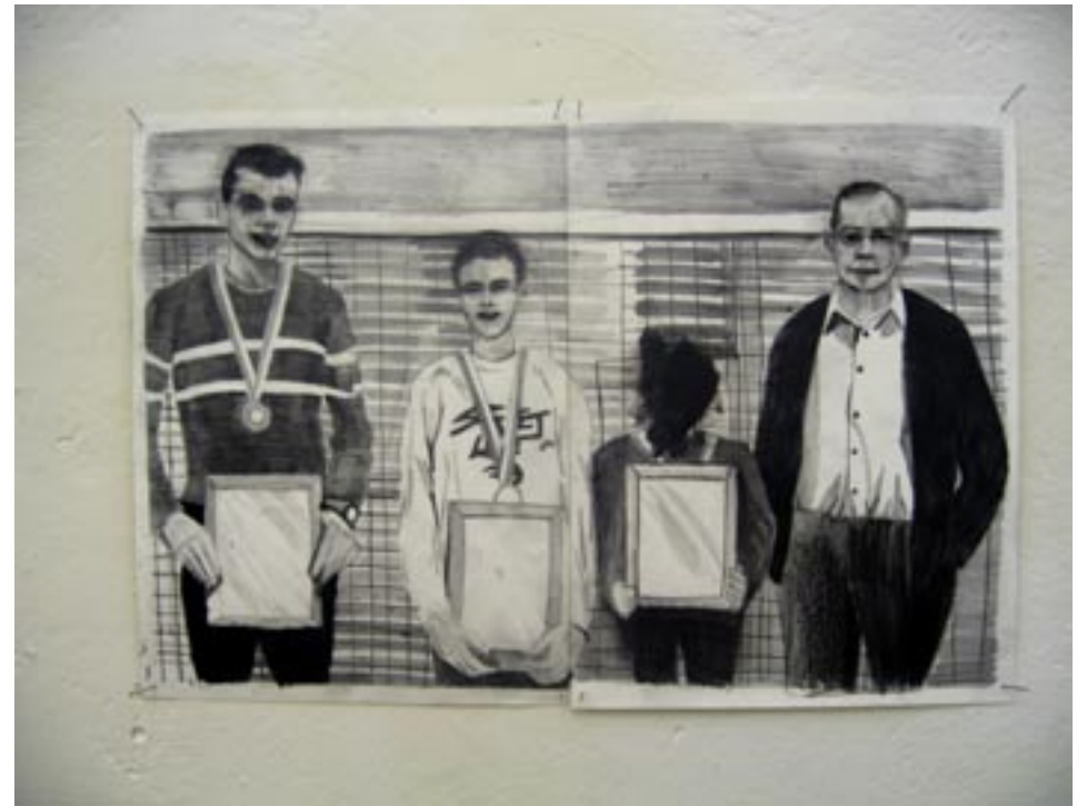
DRAWING PENCIL AND BLACK PEN ON PAPER, 60CM X 80CM, 2006