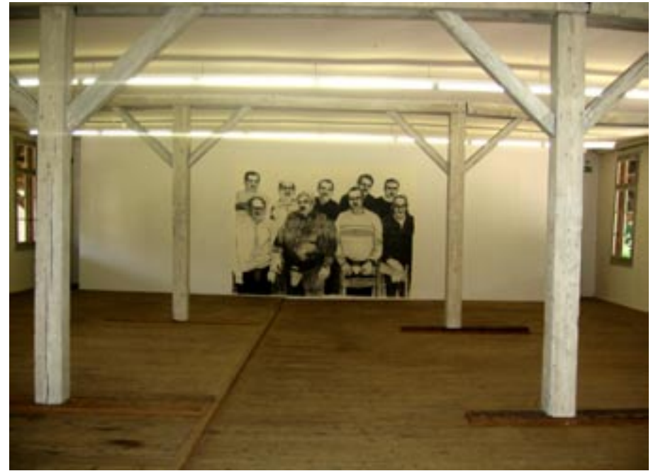
INSTALLATION VIEW, CENTRAL WALL