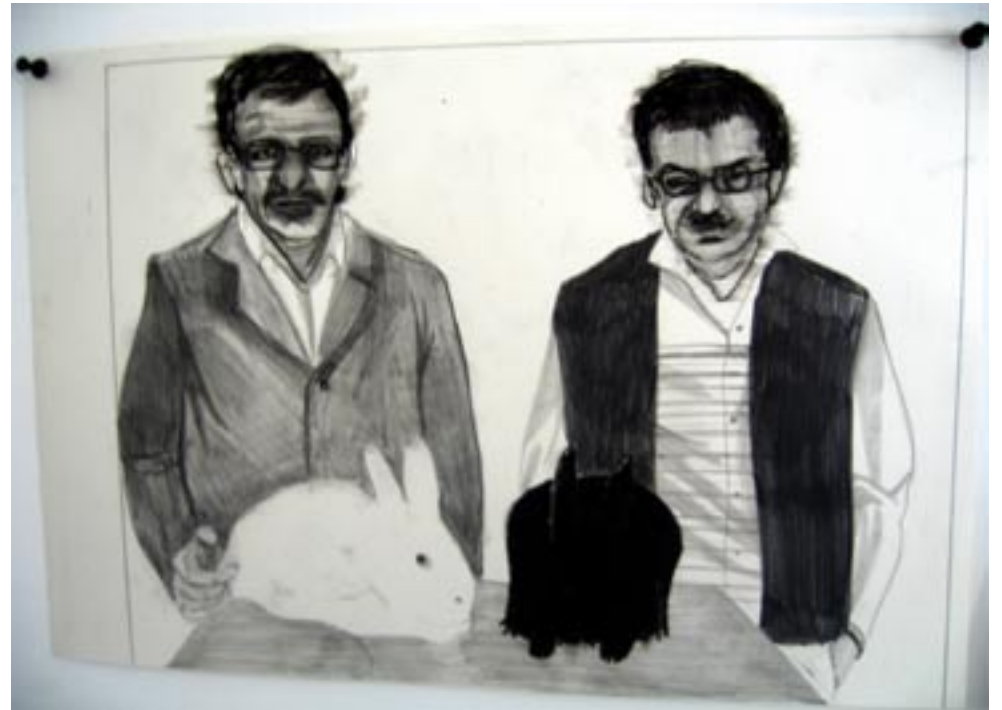
DRAWING PINED ON THE WALL, PENCIL AND BLACK PEN ON PAPER, 33CM X 45CM, (EACH)