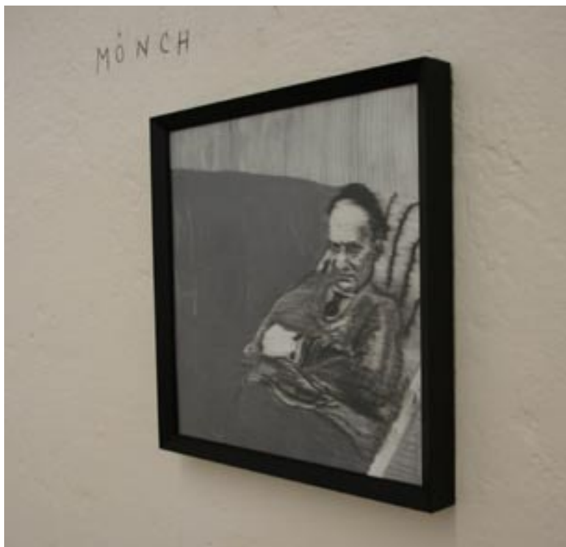
FRAMED DRAWING, PENCIL AND BLACK PEN ON PAPER, 30CM X 30CM, 2006