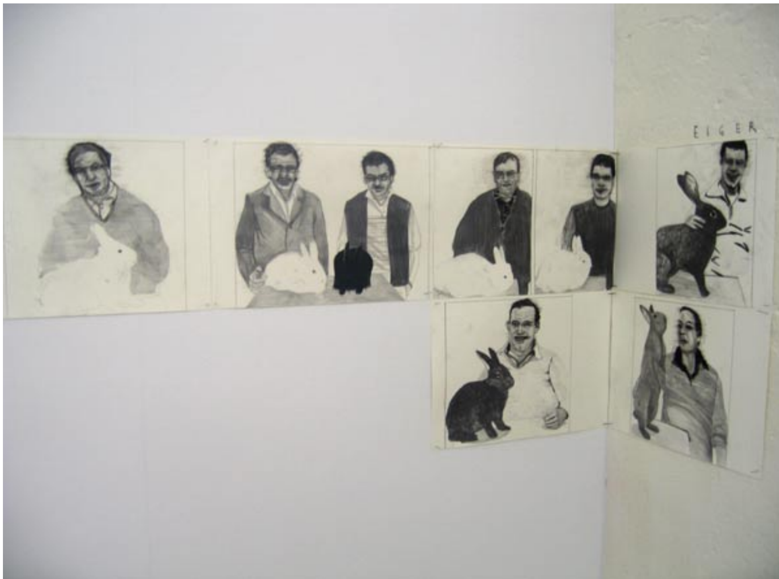
6 DRAWINGS PINED ON THE WALL, PENCIL AND BLACK PEN ON PAPER, 33CM X 45CM, 2006 (EACH)