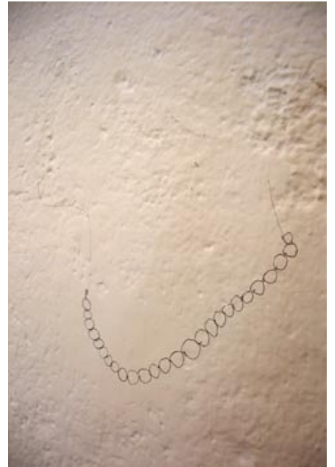
DRAWING PENCIL DIRECTLY ON THE WALL