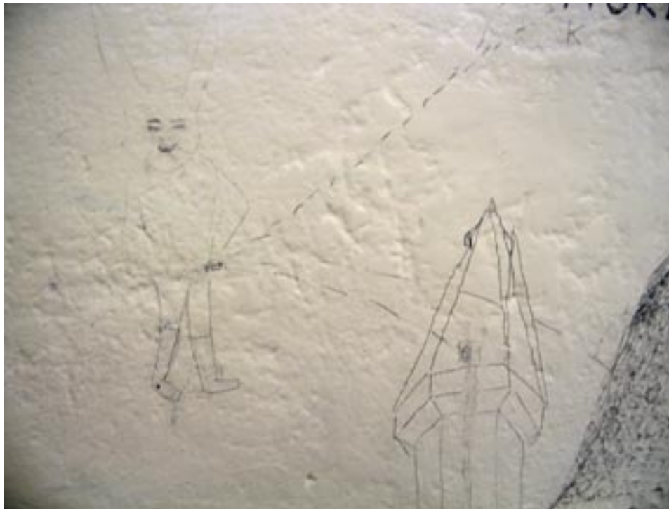
DRAWING PENCIL DIRECTLY ON THE WALL