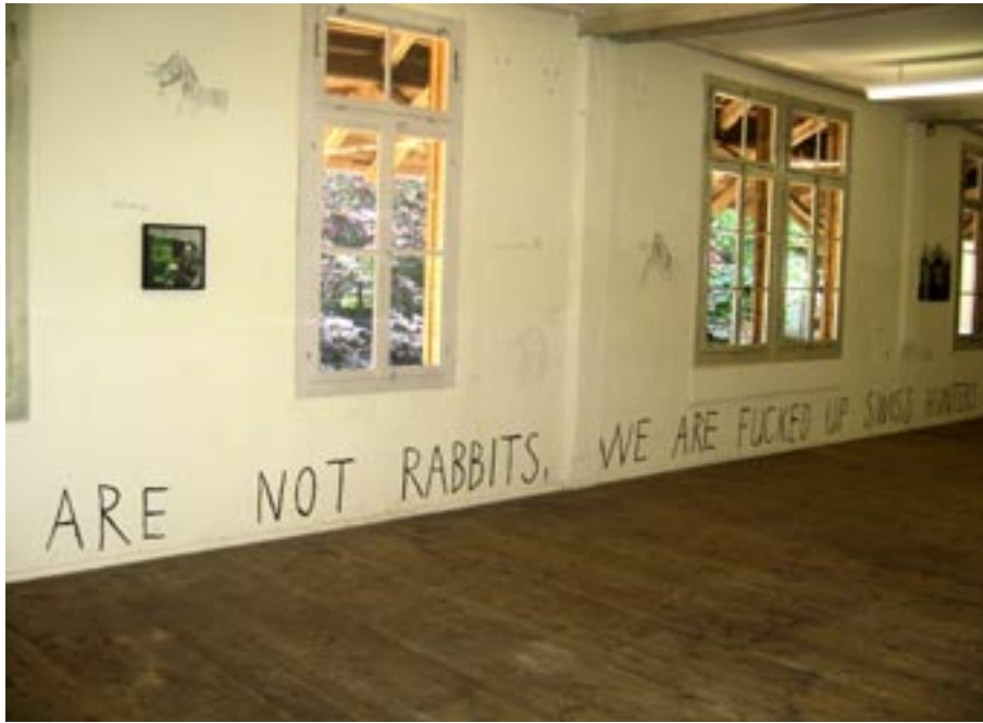
INSTALLATION VIEW, LEFT WALL