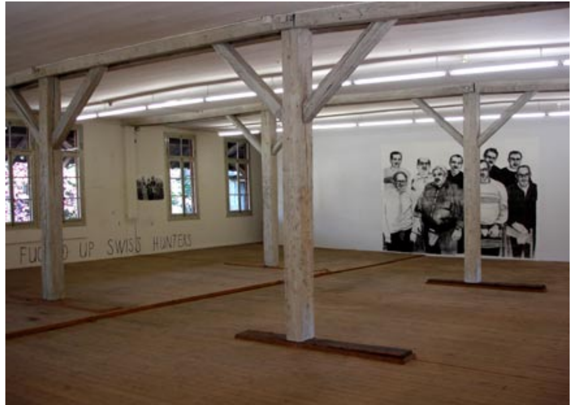
DRAWING PENCIL DIRECTLY ON THE WALL DRAWING EPNCIL AND BLACK PEN ON PAPER, 60CM X 80CM, 2006 BLACK PAINT ON THE WALL