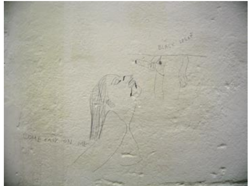
DRAWING PENCIL DIRECTLY ON THE WALL