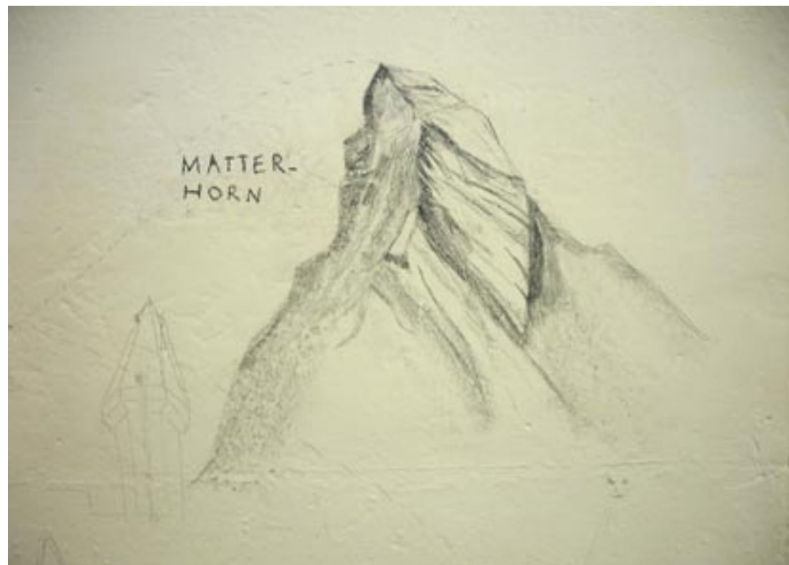
DRAWING PENCIL DIRECTLY ON THE WALL