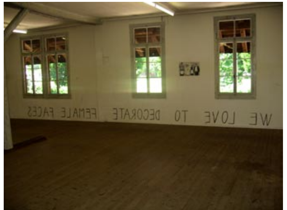
INSTALLATION VIEW, RIGHT WALL