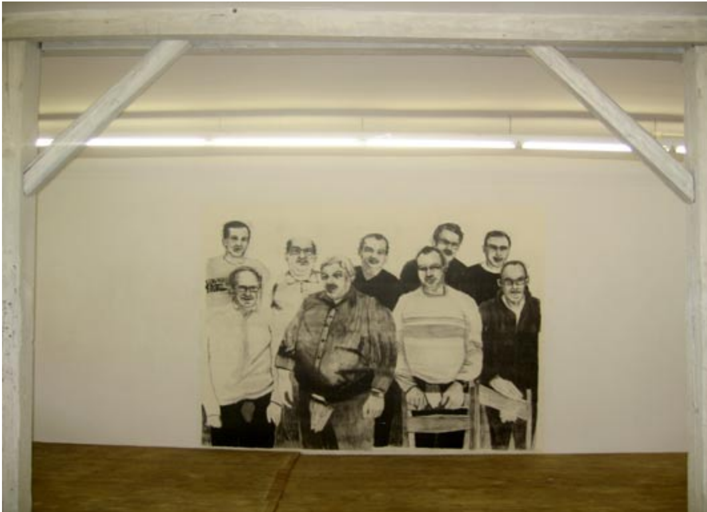
INSTALLATION VIEW, CENTRAL WALL, DIGITAL PRINT, 300CM X 400CM, 2006