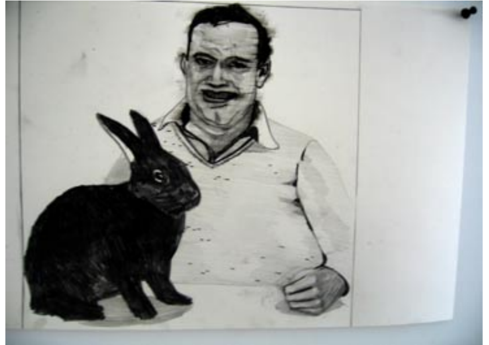
DRAWING PINED ON THE WALL, PENCIL AND BLACK PEN ON PAPER, 33CM X 45CM, (EACH)